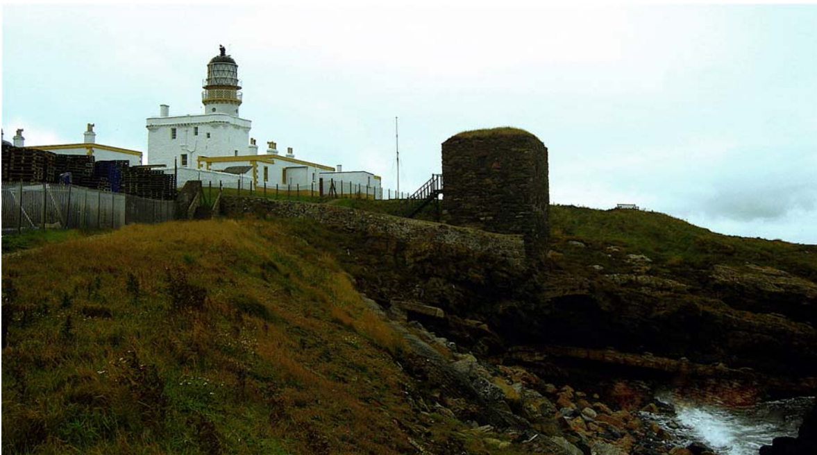
Fraserburgh Lighthouse and Wine Tower

The Big Batha and The Little Batha : “The Big Batha” and “The Little Batha” are named for two bathing pools, an upper and a lower, amongst the rocks between Broadsea and Fraserburgh; they used to warm up on summer days at certain stages of the tide and made immersion in the North Sea a rather more bearable experience.