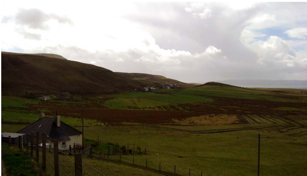
The Pennylands of Hungladder in Trotternish, Skye, where MacArthurs still farm