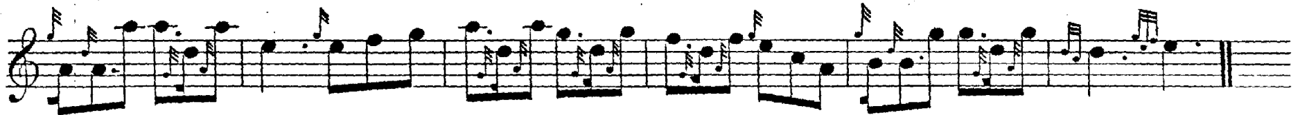
Ceòl a Bhodich.