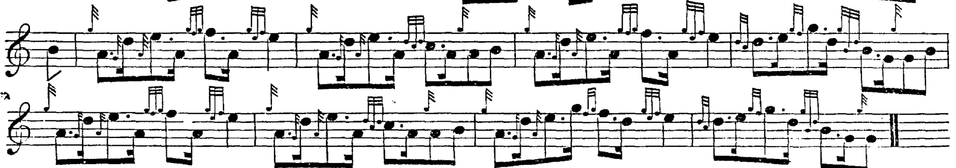
Calum Fighader, agus Calum Tàiller.